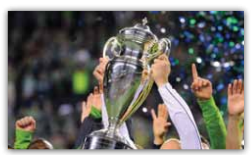
The Dewar Cup is awarded to the tournament champion

Dating back to 1914, the Lamar Hunt U.S. Open Cup is the oldest cup competition in United States soccer and is among the oldest in the world. Open to all affiliated amateur and professional teams in the United States, the annual U.S. Open Cup is a single-elimination tournament.